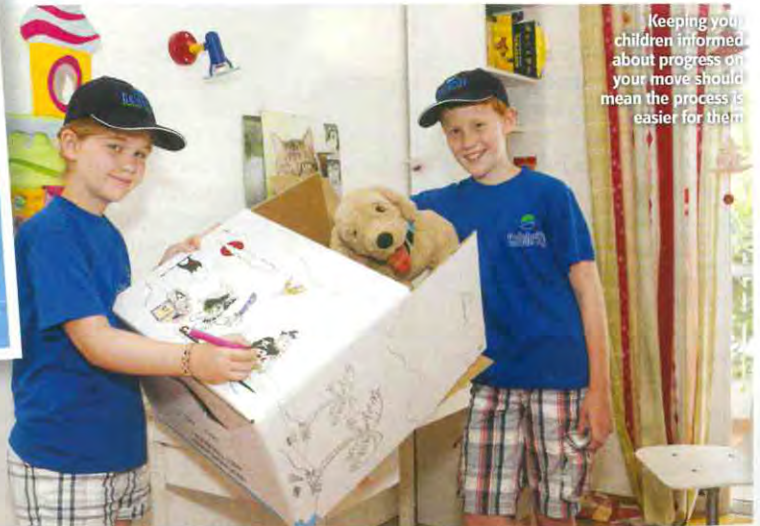
Keeping your children informed about progress on your move should mean the process is easier for them