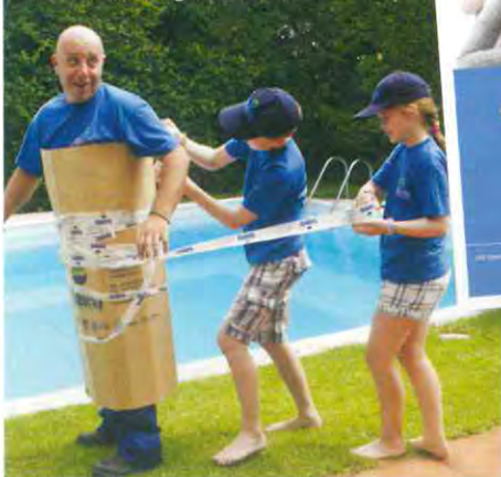
All wrapped up – Greek international movers Celebrity go to all sorts of lengths to help customer's children get involved