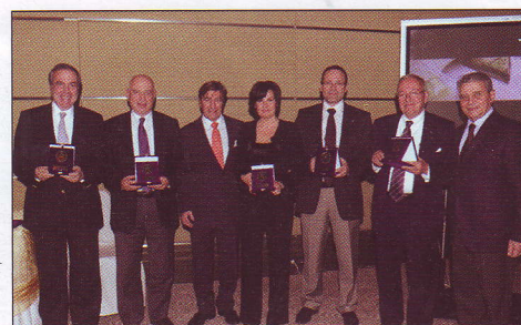
The awarded Members of HSCC