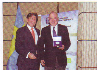
Member of the year Oriflame Hellas Ltd

On Thursday, Dec. 8, 2010, the Hellenic Swedish Chamber of Commerce organized its annual event at Athens Ledra Marriott Hotel, which was a great success.